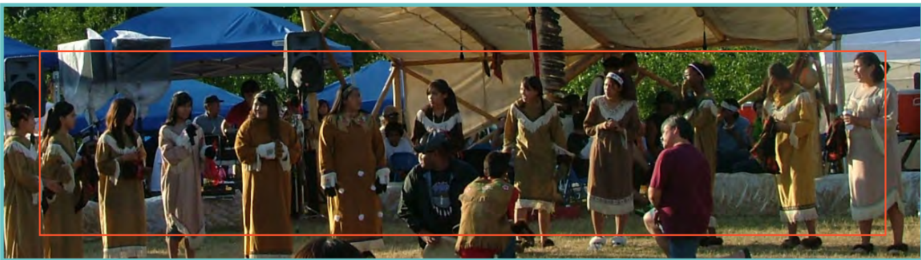
JOM Potlatch Dancers at the 2008 PowWow

FASAP moved to it's new location this past year. It is now located at 3100 South Cushman.