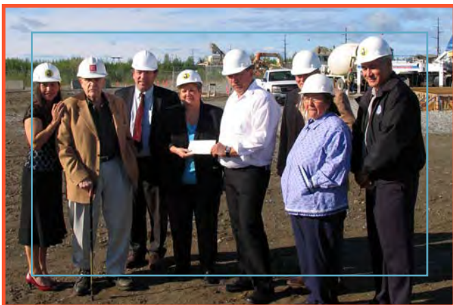
Groundbreaking April 2008