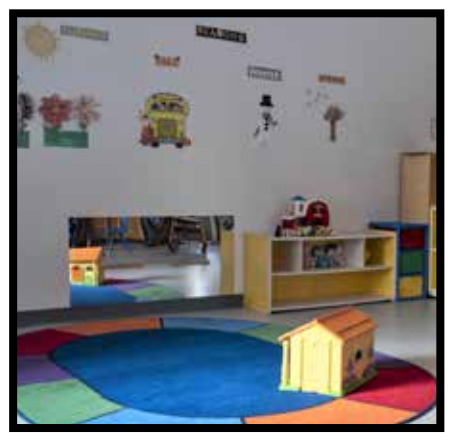
Children's daycare room

consumers navigate those issues, but the first thing they deal with is making sure the women are physically ready to withdraw