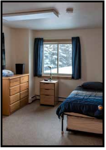
WCCIH residential room