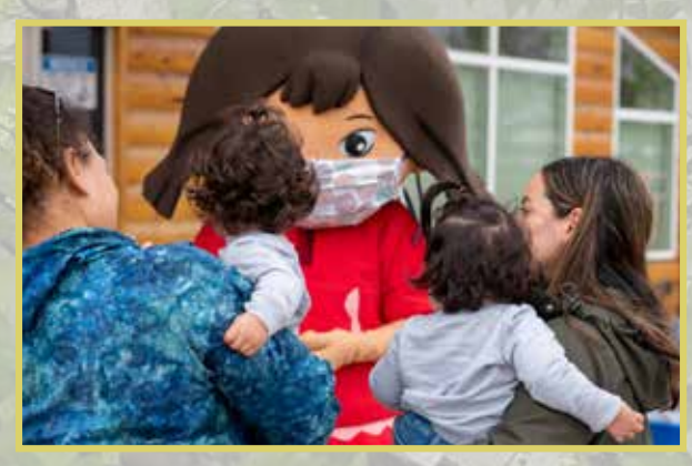
PBS's Molly of Denali greats two tots at the FNA JOM Camp Read-a-Lot drive-thru.