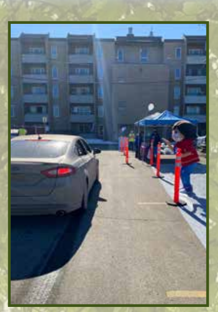
PBS's Molly of Denali waves at visitors for the FNA CS drive-thru.