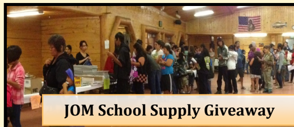
JOM School Supply Giveaway