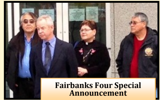
Fairbanks Four Special Announcement