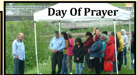
Day of Prayer