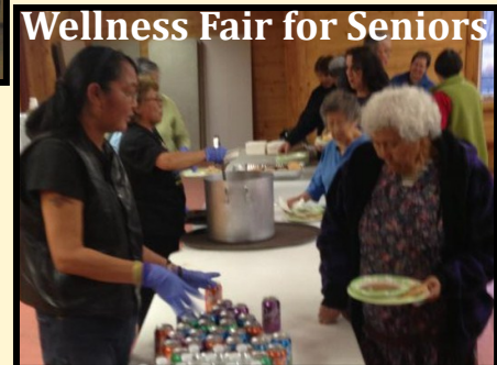
Wellness Fair for Seniors