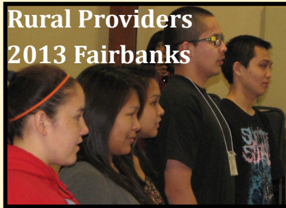
Rural Providers 2013 Fairbanks