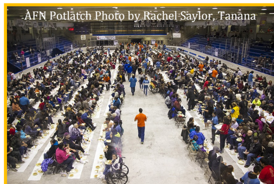
AFN Potlatch