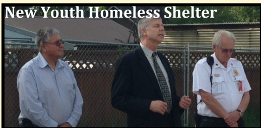
New Youth Homeless Shelter