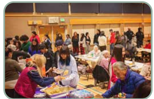
Recently, FNA's Strategic Prevention Framework program held a lunch at the Effie Kokrine Charter School. They brought students and elders together so they could hear about the work SPF is doing. SPF is also looking for youth to sit on their Youth Council. The input and direction from youth is important for the success of SPF.